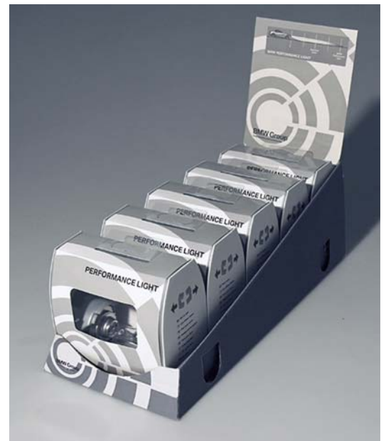
Space-saving counter display made from cardboard