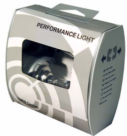
BMW Performance Light, single package